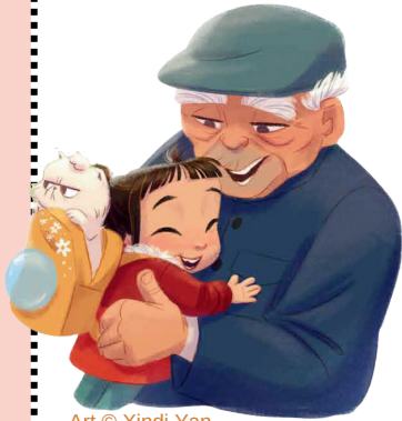
Art © Xindi Yan